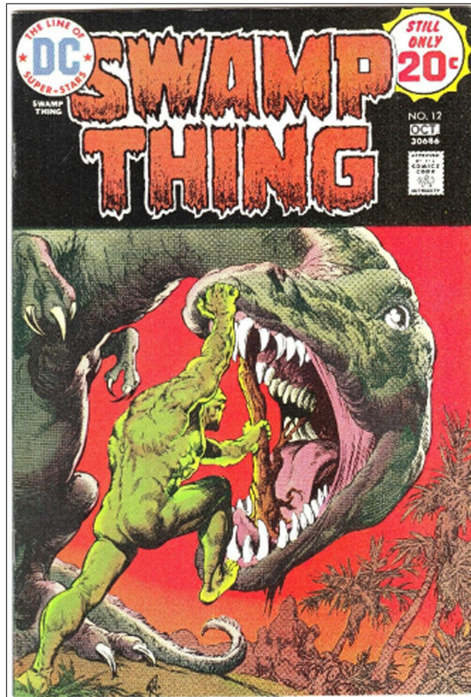
Figure 4: Wein, Len (w) and Redondo, Nestor (p). Cover of Swamp Thing #12. 1974. New York: DC Comics, Oct. 1974. © DC Comics.