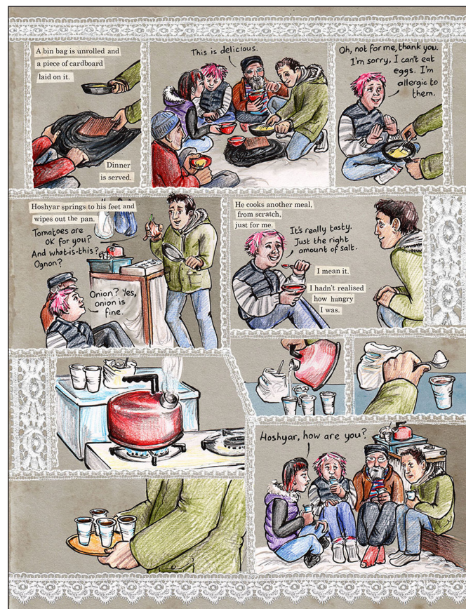
Figure 1: Kate Evans (2017) Threads from the Refugee Crisis (New York: Verso, 58). © Verso New York. Image presented with permission of Kate Evans and Verso.

Lace is present on almost every page of Evans' comic, as demonstrated in Figure 1 . It fills the gutters between panels, placed in a rough, collage style, often overlapping.