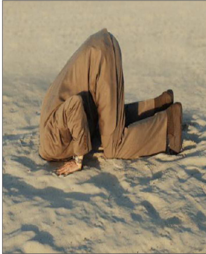
Figure 4: Image appearing in judgment of Posner J in Gonzalez-Servin v Ford Motor Co 662 F.3d 931 (2011). Case report on public record.

There is also some pertinent Australian case law which has gone unspoken in the debates surrounding the enforceability of comic contracts. Aintree Holdings Pty Ltd v Ground & Foundation Supports Pty Ltd [2008] WASCA 225 provides some of the strongest support yet for the idea that visuals can themselves acquire contractual status. In that case, building company Aintree requested that Ground, a geotechnical engineering firm, submit a tender for some construction works on one of Aintree's client's properties at Mount Pleasant, South Australia. The works involved the erection of lightweight sheet piling on two of the property's boundaries to act as a temporary retaining wall. Aintree's request for tender was accompanied by architectural