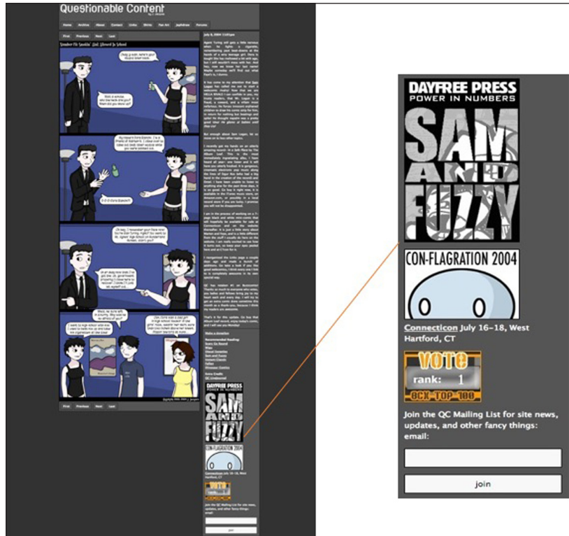
Figure 1: Jacques, J (2004) Smoking Ain't Allowed in School Questionable Content . First appeared in July 2004 as shown. Comic available at https://www.questionablecontent.net/view.php?comic=151 ; Ad accessed via the WayBack Machine and no longer available.

and Logan, as individuals, still have to compete for the limited resource of attention, but they do so by bolstering one another's web status via links. During this period, the currency of links in the early Google search algorithm encouraged partnerships that helped individuals compete in an increasingly crowded marketplace. That spirit of cooperation causes us to rethink traditional notions of romantic authorship, particularly as authors position themselves as readers of one another's work.