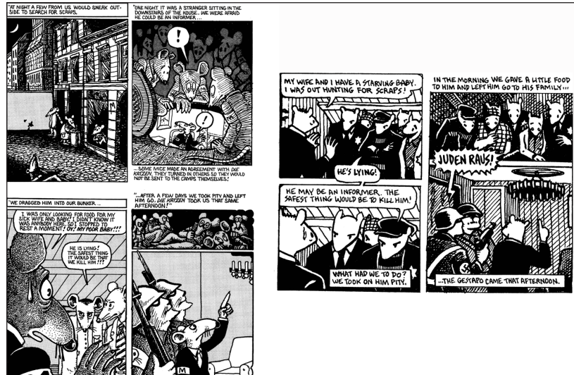
Figure 3: Selected panels from the 1972 version of 'Maus' (left) as compared with corresponding panels from the graphic novel version of 'Maus' (right). Note the different 'acoustic' experiences created by the arrangement of the marks in these two examples. (Images © Art Spiegelman 1974 and 2003).

one that was only three pages long (1972). Both comics are called Maus (Figure 3). The earlier version was drawn in black ink using processes well established among underground cartoonists by 1972 (Rosenkranz 2002, Estren 1993). It was drawn at a large scale and reduced in reproduction to fit the standard American comic book page. The graphic novel version of Maus , however, is widely recognised as a departure from this countercultural tradition; the harbinger of the new comic book form that we know as the graphic novel. I want to suggest that this departure is evidenced as much in the radical concept of the long form graphic memoir as it is in the peculiar rules and procedures that Spiegelman set for himself in the cartooning workflow, specifically, those regarding the relationship between the size of the material drawing space and the printed page. Spiegelman writes: