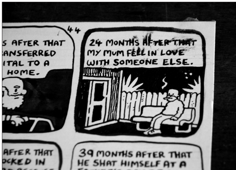
Figure 2: The material struggle to tell this story in tiny images is most apparent in this one haunting panel of my father smoking alone outside the nursing home.

To cartoon is to make marks that are locked within a nest of cages. Some of these cages are created by the author. Some are created by the conventions and idioms of the visual language. Some are created by the practical restraints of the workflow. Either way, the friction between the cartooning body and the walls of these cages is an essential component of style. A cage is nothing if it is not a device for controlling the movement of bodies.