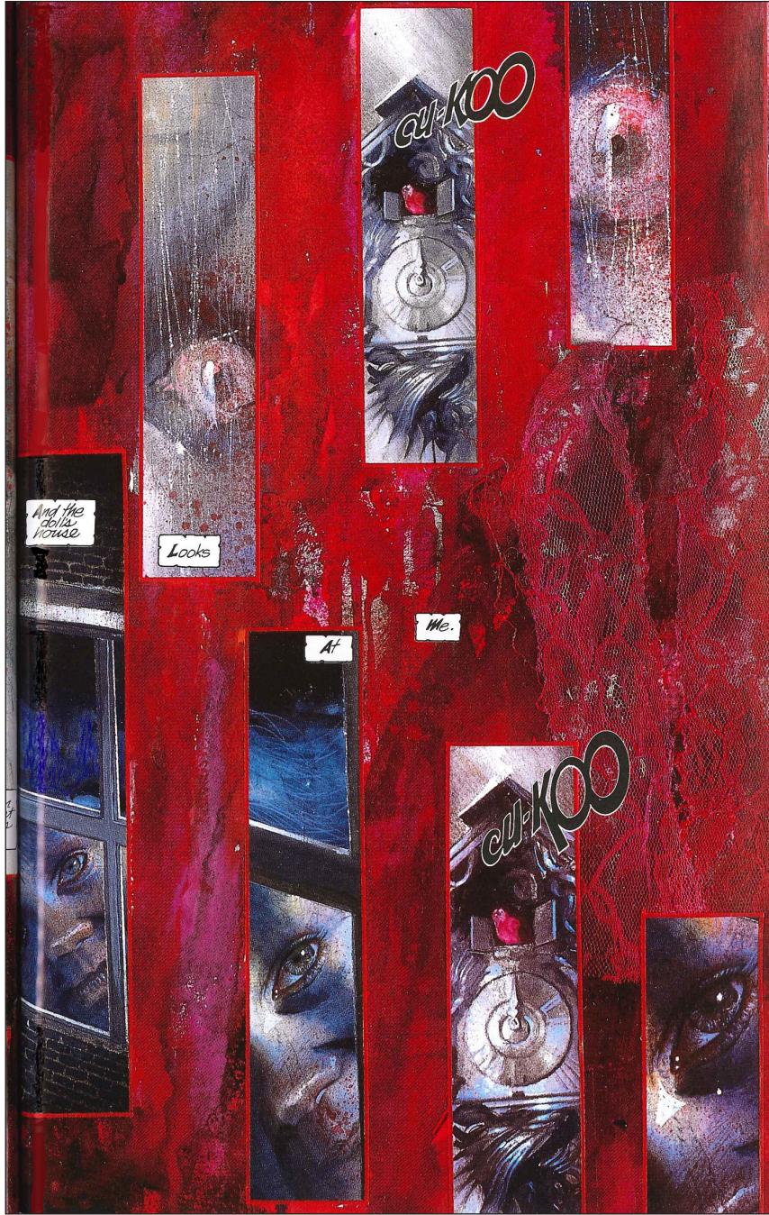
Figure 3: A page from Arkham Asylum – A Serious House on Serious Earth (Morrison and McKean, 2004) p. 35.