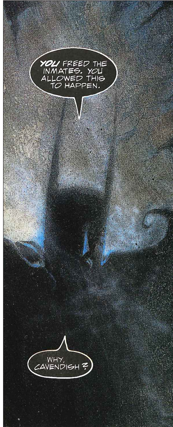
Figure 2: A panel from Arkham Asylum – A Serious House on Serious Earth (Morrison and McKean 2004) p. 53. © DC Comics.