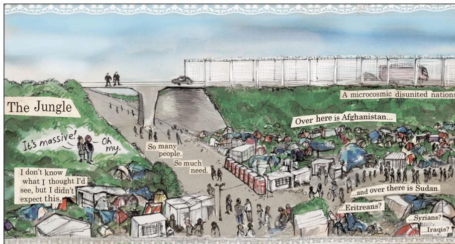
Figure 1: Excerpt from Evans, Kate (2017) Threads: From the Refugee Crisis (London & New York: Verso) © Kate Evans.

is recognisably human. With film, you have to alter someone's voice or black out the face which depersonalises the story teller. With comics, you can simply select another face and draw them differently.