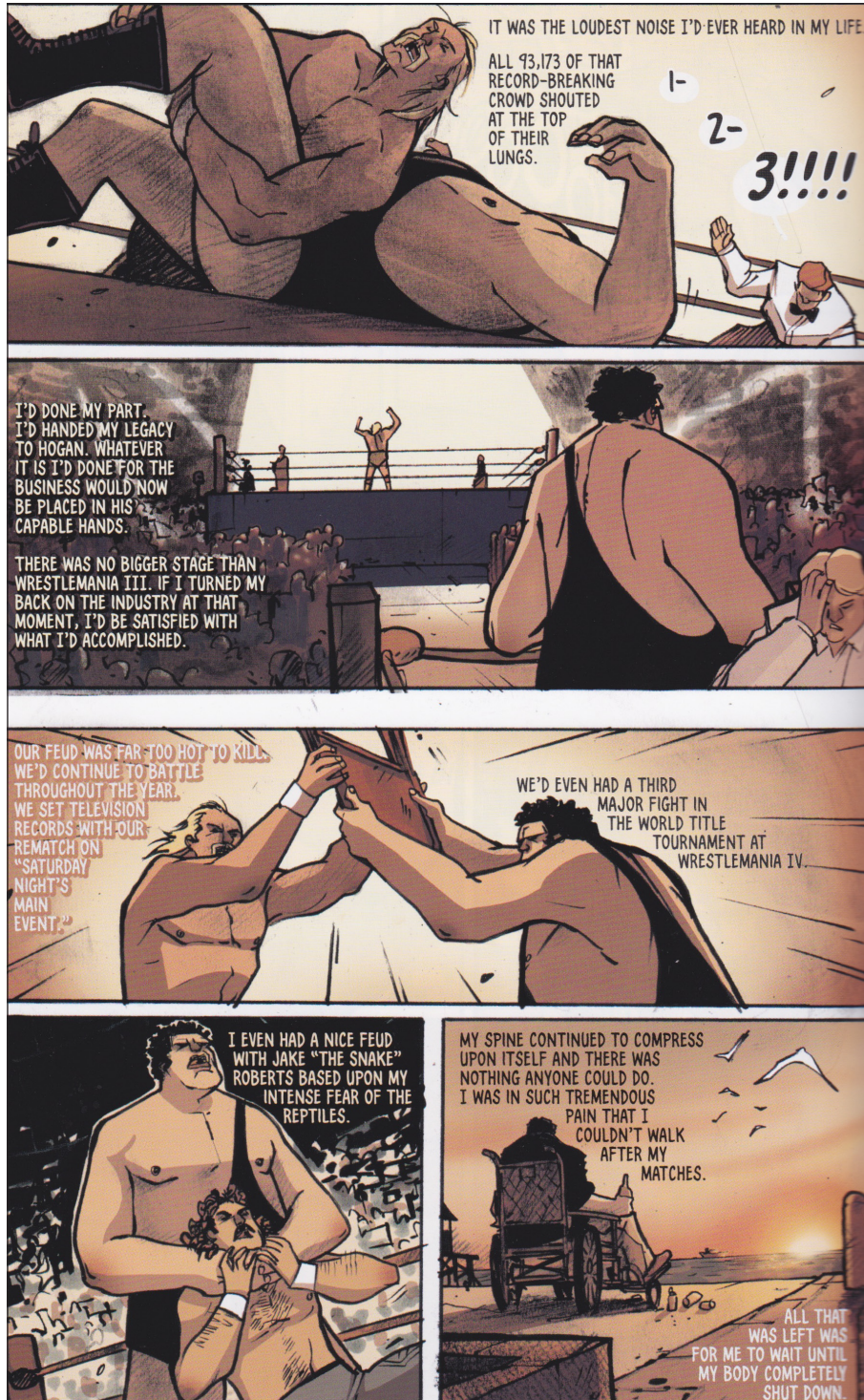
Figure 4: Andre the Giant leaves Wrestlemania III after being defeated by Hulk Hogan. Brown, B (2014) Andre the Giant: Life and Legend (New York: First Second, 210).