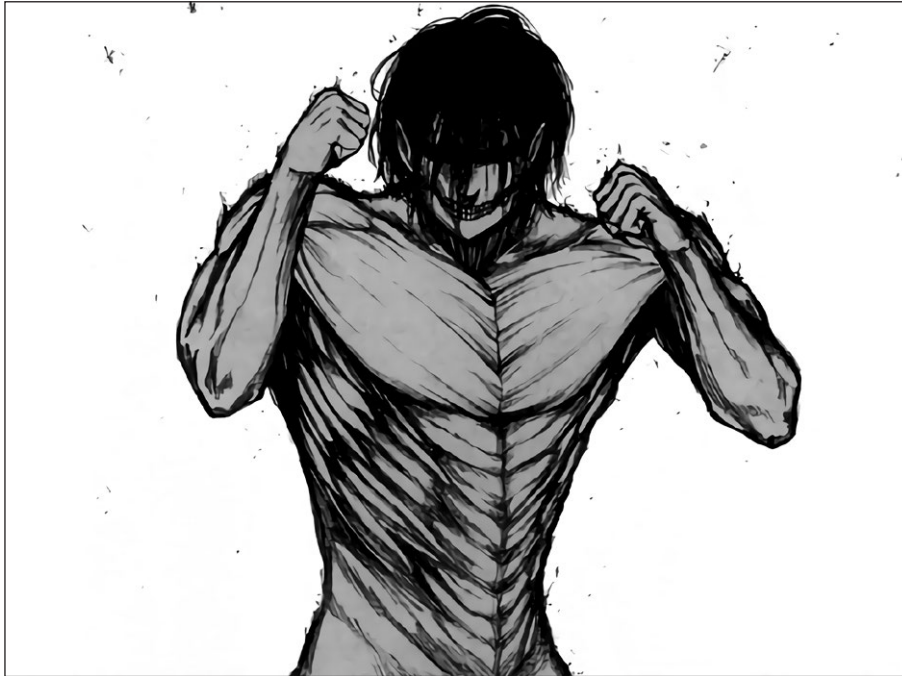
Figure 3: Eren Jaeger in his Titan form (vol. 2, p. 141, 2010). Notice the elfin ears and the powerfully build body. © Isayama, Haijime, 2009–2017.

turns its inhabitants into mindless Titans in a traumatic, dehumanizing process that creates monsters out of simple villagers. Hence, the ‘devourers’ are a tool of ‘flak’, a consent tool used to keep humankind captive, but also victims of this very consent filter. Titans are at the same time ‘inside’ and ‘outside’ the closed control system of the world, since they are the very ‘terror’ that the survey groups fight, and other humans fear.