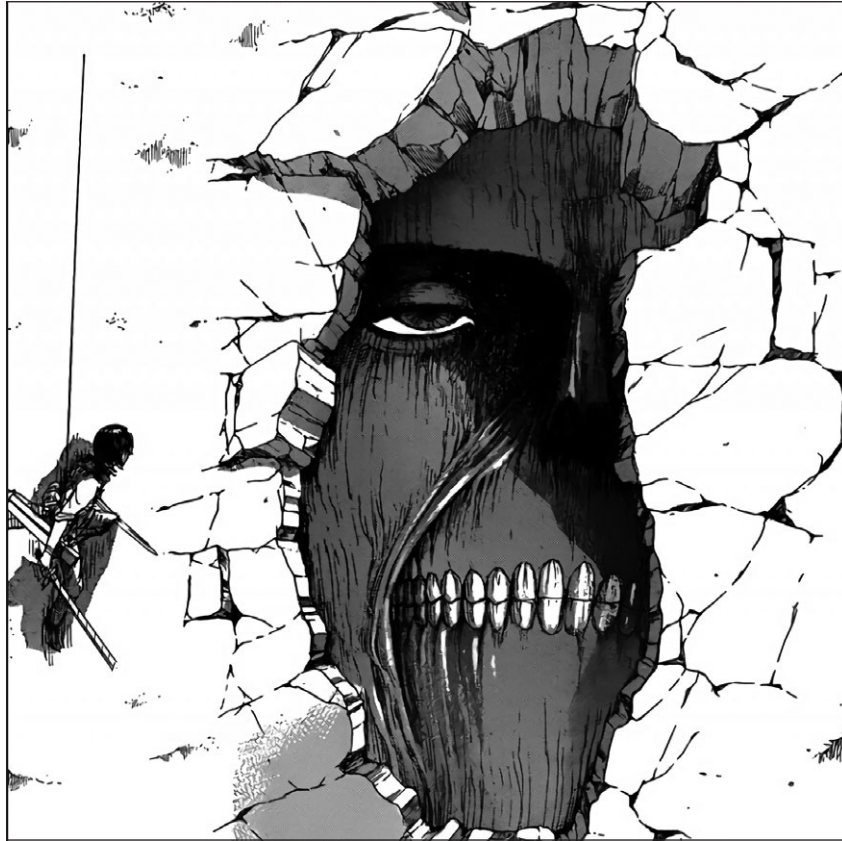
Figure 4: A Titan's face appears from the wall (vol. 8, p. 130, 2012). It is implied that each section of the walls contains a colossal (50 meters tall) Titan.

In the Clash of the Titans arc (vol. 9–13, #34–50), a crucial change in the information that characters can access occurs. A Wallist priest, Father Nick, begs the survey corps to cover a damaged section of the walls. Father Nick reveals that the walls are made of the solidified skin of giant Titans, and that the royal family possesses the 'coordinate' power: they can force any Titan to obey their will and erase any memory of the citizens within the walls. Father Nick also reveals that 'Krista Lenz', a cadet, is Historia Reiss, the illegitimate heir to the royal family. By talking with her, the survey corps learn more about the secrets behind the world, its walls, the Titans, and those who control these factors.