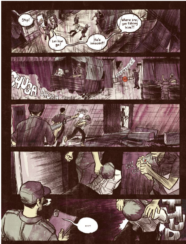
Figure 1: Tran, GB (2011) Vietnamerica (London: Villard, 69).

The mind's protective shield is not engaged in time; the threat to the self is recognised one moment too late. If trauma exists separately from comprehension, then it has never been known fully or, indeed, understood and has therefore not existed in time. It is this lack of temporal understanding and direct experience that causes the traumatic rupture and leads to the development of traumatic symptoms. I reiterate my initial point: time – and the fracturing thereof – has an effect on all other symptoms of the traumatic rupture; it is this rupturing of time that we see in the representation of Tri's story in Vietnamerica .