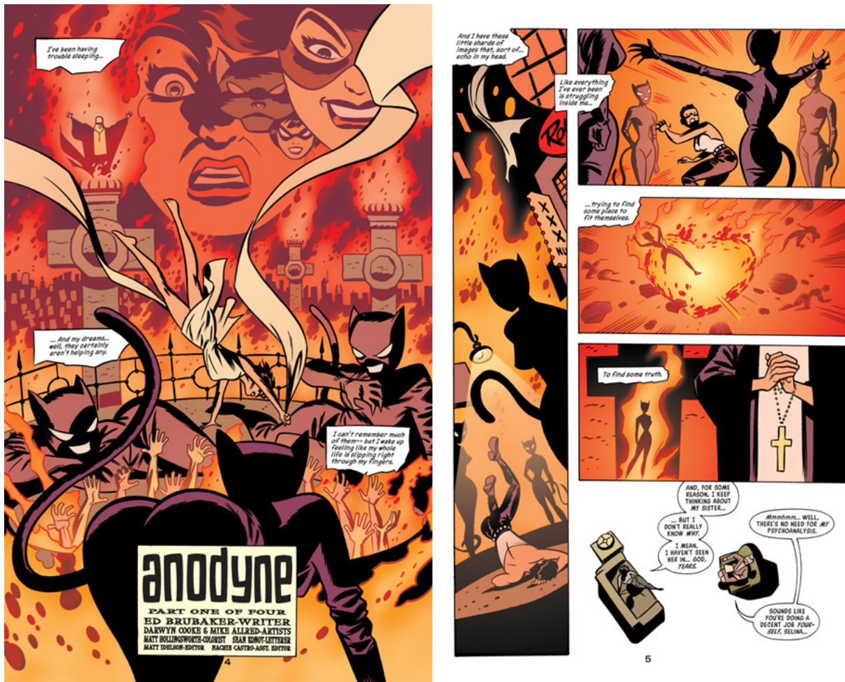
Figure 2: In her dreams, Catwoman is separated from Kyle; Catwomen surround the helpless Kyle and burn away her humanity, leaving just Catwoman in her place: Brubaker, E Cooke, D, and Allred, M (2002: 43–44) Catwoman: The Dark End of the Street . (New York: DC Comics). Copyright © 2001, 2002 DC Comics.

While Kyle and Catwoman embody just two persons that inhabit their body, there are multitudes of others. Ignoring the staunch differences in attitude and mannerisms between Kyle and Catwoman, both characters pronouncedly vacillate in skin tone and costume within themselves—even just within this single comic book. For instance, while the panels within the comic showcase a Catwoman who is very overtly a pale Caucasian brunette, the various covers from this same comic depict a darker complected Kyle that is clearly mulatto, Hispanic, or even Italian (see Figure 3 , left side). However, even this ethnic alteration pales to the disguises that Kyle dons that make her unrecognizable, the staunchest of which is when Kyle goes undercover as a blond bombshell (see Figure 3 , right side). Thus comic's art work is indicative of Kyle and Catwoman's personality and multiplicity. Despite all of her various incarnations, Kyle and Catwoman are always at their cores women: "She was a 'woman,' and all woman at that" (Madrid 2009: 248). Kyle summons up her female alter egos, uses them as tools, and discards them just as quickly. Kyle can control all these incarnations of herself—other than Catwoman.