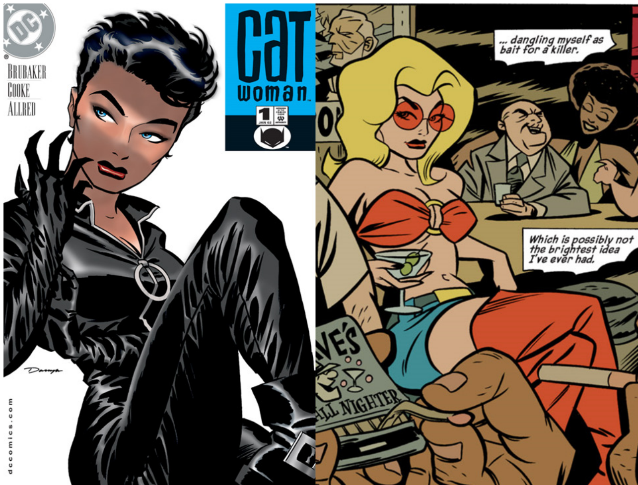
Figure 3: The Many Faces of Catwoman, from darkly-completed brunette to blond bombshell: Brubaker, E Cooke, D, and Allred, M (2002: 39 & 103, panel 1) Catwoman: The Dark End of the Street . (New York: DC Comics). Copyright © 2001, 2002 DC Comics.

reflect the purely bad side of Batman—like counterparts, or mirrors showing him what would happen to him if he lost control” (Reichstein 1998: 346–347). However, Catwoman should not be reduced to simply reflect the bad side of Batman. While Bruce Wayne is similar to a Dr. Henry Jekyll, Batman is not a complete Mr. Edward Hyde... but Catwoman is.