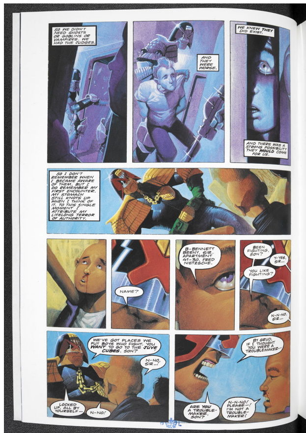
Judge Dredd: The Complete America, 2003, by John Wagner and Colin MacNeil

AE: Yeah, the exhibition itself does have a parental advisory notice. But that's not the only place where there will be warnings. I mean, there's the gratuitous violence, and that, I think, is more offensive... And some of the racial stuff... There's an Enid Blyton comic from the 50's - a strip that she did for papers in the 1950's - it's just not acceptable to us today, but obviously it was seen as acceptable then. There's a lot of things that people might find offensive in the exhibition actually, that's what it's there to do - it's to challenge and get you thinking. Within the sex section we'll have for example the... I haven't really mentioned audio... the piece of Rupert the Bear and Gypsy Grandmother in the Schoolkids issue of Oz , and with that we'll have audio from the obscenity trial itself, so we can hear some of the things that were said, because unusu-