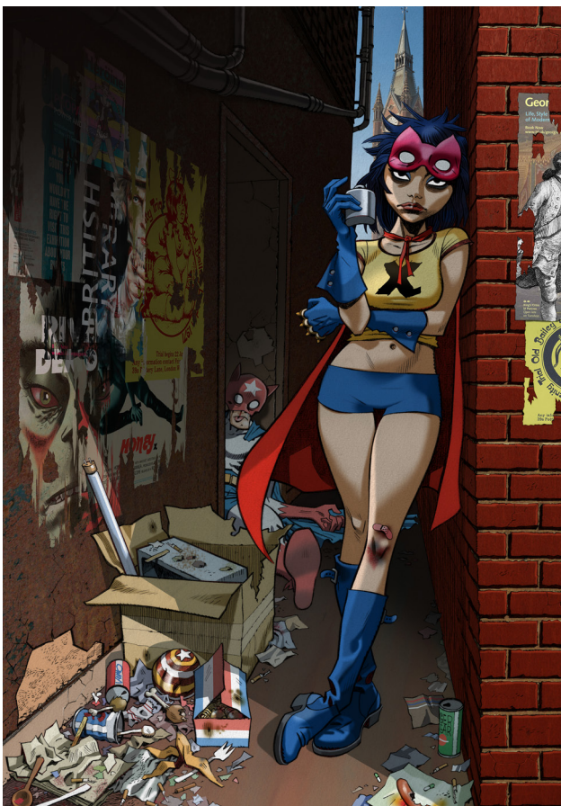
Jamie Hewlett design for Comics Unmasked at the British Library © Jamie Hewlett 2014.

Keywords: British Library; libraries; comics; comic books; UK; Comics Unmasked; exhibition; art