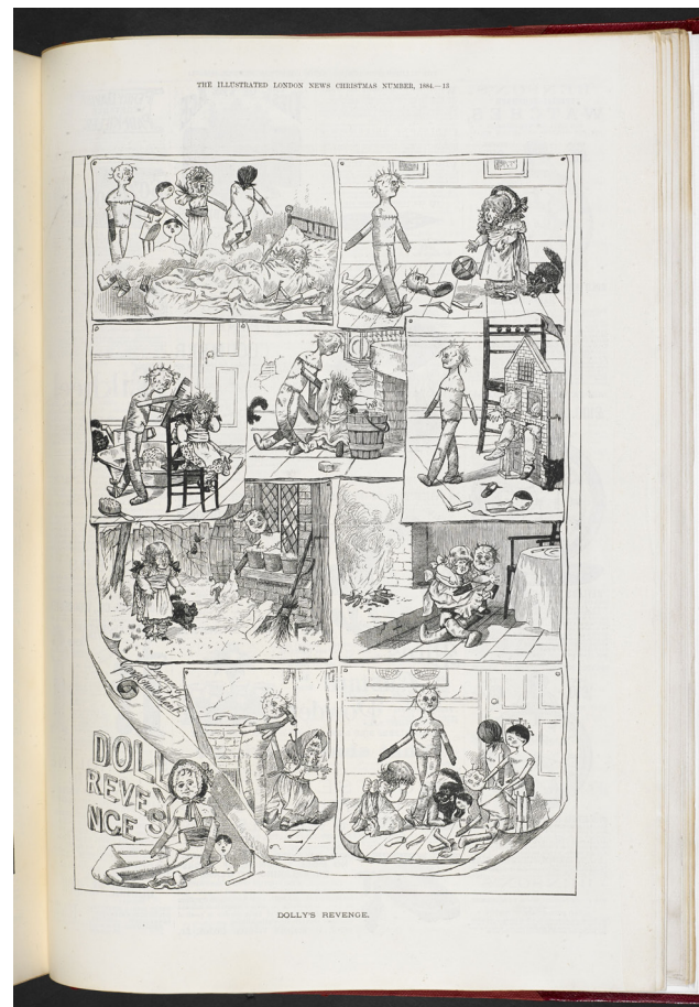
"Dolly's Revenge". The Illustrated London News .

AE: There's some fascinating stuff. There's so many things that are exciting about this, but some of the 19th century comics that we found, such as the ones in The Graphic and The Illustrated London News , you actually have places where, in the Christmas issues, members of the public could write in and send sketches of things, stories that happened to them. And the in-house artists would draw them up as comics. You actually get, from the 1880's, a glimpse of what a young woman on a ship going across the Atlantic felt about being pursued by various gentlemen, because she expressed this in these